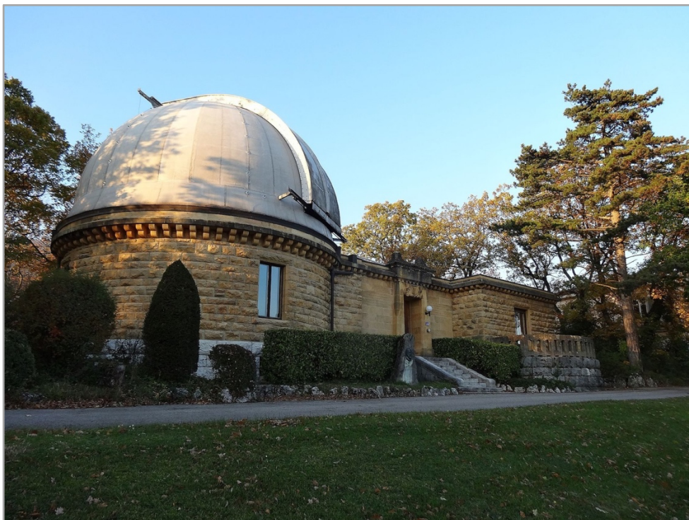
Neuchâtel Observatory / Hirsch Pavilion

Neuchâtel has a long and illustrious role in the history of timekeeping and chronometry and represents the ideal venue for this inaugural edition of a series of seminars dedicated to the PNT community.